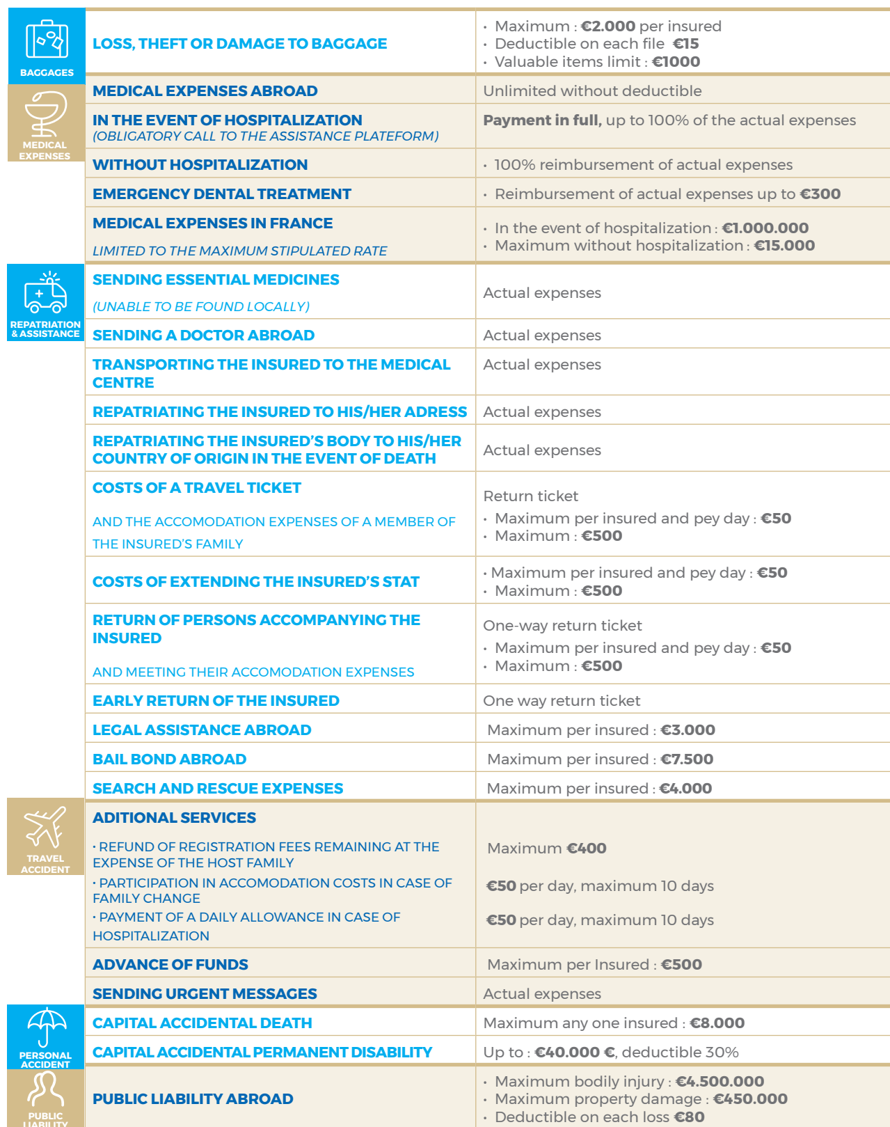
TABLE OF LIMITS

TRAVEL INSURANCE AND ASSISTANCE SINCE 1981